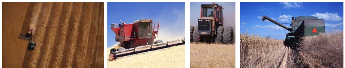
SWEPACO 709 provides superior lubrication of hydraulics in all types of agricultural equipment.

Modern agricultural equipment is expected to handle tougher jobs than ever before. They require lubricants which will properly protect them under increased demands of load, speed and temperature.